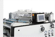
热刀 Hot knife