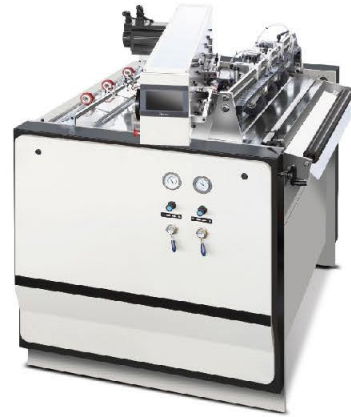
FCD-1100 链刀割纸机 Chain Knife Slitting Machine (Suitable PET PVC)