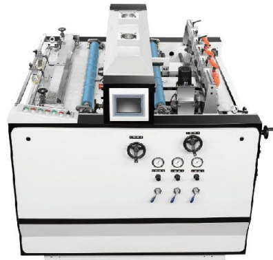
FCH-1100 热刀割纸机 Hot Knife Cutting Machine