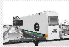
链刀 Chain knife