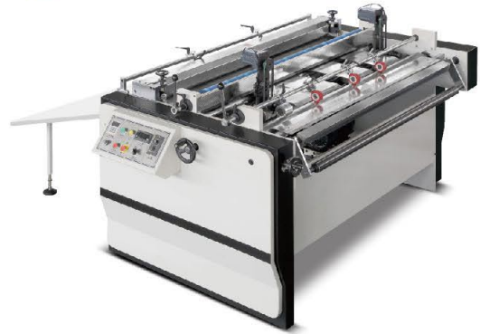
FCC-1100 自动割纸机 Flying Knife Slitting Machine