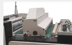
除粉机 Powder remover