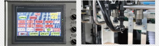
电脑控制界面 Computer control interface

注: “●” common standard 标配 “◎” option standard 选配