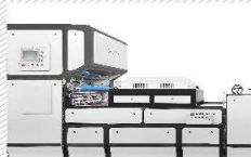
贴窗覆膜 Window laminating