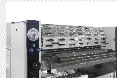
双压辊 Double pressure roller